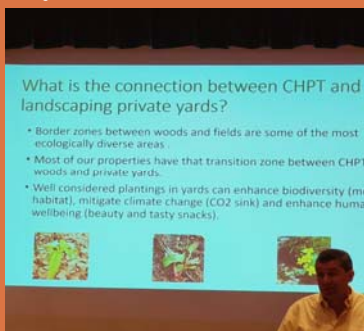
Bill Introducing CHPT