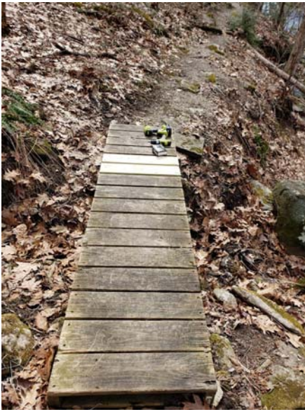
Fresh boards at Little River

desert, but doesn't have to be. Replacing a two foot wide strip of border with native plants becomes a mini-oasis for pollinators, birds and family foragers.